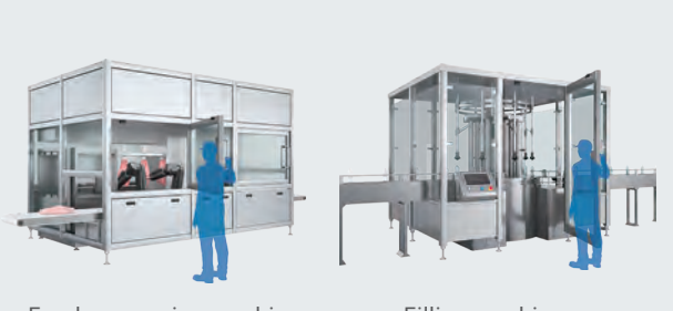
Food processing machine